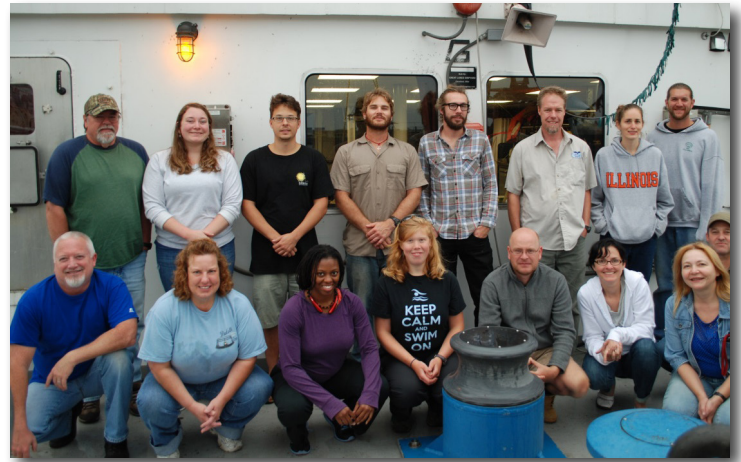
GLC researchers with EPA and USGS scientists and the crew of the Lake Guardian .

Analysis of collected data will allow us to estimate lake-wide and habitat-specific benthic invertebrate abundance and biomass of Lake Erie this year and identify the long-term trends in dynamics of this extremely important community. Results