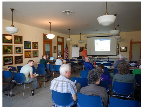
iMapInvasives training at Roger Tory Peterson Institute, Jamestown, NY.

Discussions with those we spoke with varied based on geographic location, proximity to urban, suburban and rural settings and their various economic and environmental interests. This required talking points to be fluid and adaptable for different audiences. Listening to questions and concerns from the public helped drive changes in what outreach topics and materials WNY PRISM developed and focused on. It became clear that certain species like the emerald ash borer and zebra mussels had greater recognition due to media exposure and initiatives such as "Don't Move Firewood" and "Clean, Drain and Dry." This allowed for more in-depth conversations about similar species and important early detection species such as Asian longhorned beetle and water chestnut. New outreach materials such as "Plant Wise" were added in order to promote the planting of native vegetation in yards and gardens while also raising awareness of common cultivars that are invasive. We also held invasive species