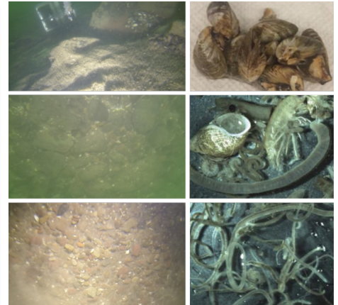
Knut Mehler collecting benthic samples from the lower Niagara River (left). Common substrate and associated benthic fauna from lower Niagara River (above).

In total, 257 sites were chosen along the lower Niagara River based on the habitat map and sampled throughout July and August with 124 benthic samples obtained. Additionally, 80 videos were taken and analyzed to describe the substrate in areas which could not be sampled due to strong currents or rocky substrates. 60 sediment samples were taken to determine the grain size distribution and the organic matter content of the substrate