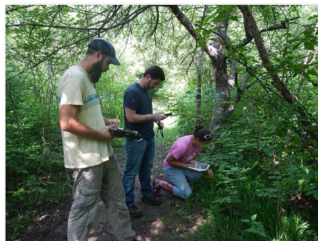
Invasive species management crew identifying and mapping invasive species at Bergen Swamp.

Invasive species management doesn't stop at education and outreach. The WNY PRISM Invasive Species Management Crew conducted invasive species mapping surveys at 19 different locations throughout Western New York. Surveys encompassed an array of different landscapes from established nature preserves such as Reinstein Woods, to navigating through the forested hills of Allegany State Park in search of the hemlock woolly adelgid ( Adelges tsugae ) and canoeing Tonawanda Creek in search of the aquatic invasive plant, water chestnut ( Trapa natans ). Over 2500 observations were made during the course of this summer, including 60 different invasive species. It is important to note that these surveys were intended to represent a general assessment of the invasive species found on the property and that each observation did not represent a single individual, but in most cases signified a population of a species. All collected data was uploaded to www.imapinvasives.org and can be accessed for future educational and eradication efforts.