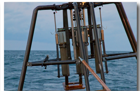
The multicore array with four sediment cores.

In addition to routine benthic samples, stations were added to more closely monitor the native amphipod (scud) Diporeia spp. Diporeia has shown sharp decreases in abundance in all of the lakes except Lake Superior where a healthy population still exists. In response to this, researchers at Cornell University are searching for viral infections that may have led to the collapse. GLC researchers collected samples of Diporeia for Cornell and for the EPA benthic database.