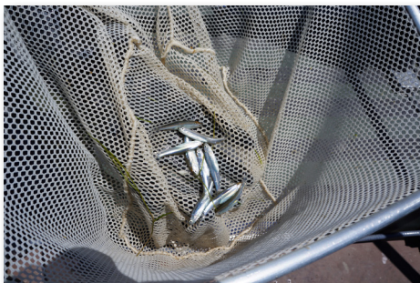
Emerald shiners in a net.

Larval seining weeks are shorter and are conducted at six sites in the upper river. Two seine nets are utilized: one for juvenile fish and another that has a much smaller mesh, allowing for the collection of larval fish. With the field season coming to a close, we will turn our focus to analyzing what we have collected