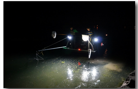
Some of the electrofishing collections took place at night.

Working out in the field has given us the opportunity to obtain a skill set that will benefit us in the professional world of scientific research. Spending a lot of time on a unique river like the Niagara has allowed us to experience how complex and diverse large riverine systems are. Unfortunately, such systems are often influenced by a number of anthropogenic stressors. The impacts that humans generate on these systems are portrayed throughout the upper Niagara River through habitat degradation, shoreline development, pollution, flow modification and much more. Our project aims to quantify how some of these factors influence the emerald shiner population, along with understanding many other aspects of this understudied species. We are excited for the future of this project and expect that our accomplishments will benefit the Niagara River and potentially other aquatic ecosystems. •