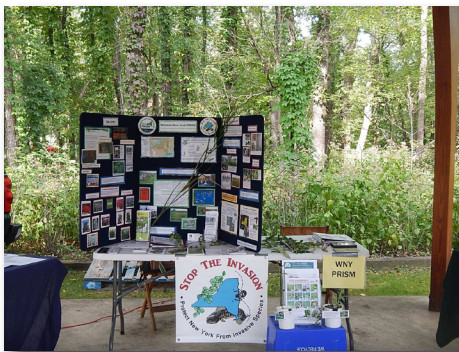
Outreach display at Reinstein Woods Fall Festival on September 20.

This summer, WNY PRISM aimed to increase its profile through education and outreach initiatives that took place across the Western New York region. Equipped with large displays, informative handouts and specimens of invasive species, staff attended local fairs, farmer's markets and other community gatherings to raise awareness of the environmental, economic and human health impacts invasive species have on our region. Over the course of 3 months, WNY PRISM staff directly engaged more than 1,200 people at 22 different events. These events ranged from the highly attended Erie County Fair and Canal Fest of the Tonawandas, to smaller local gatherings like farmer's markets and Great Lakes Awareness Day.